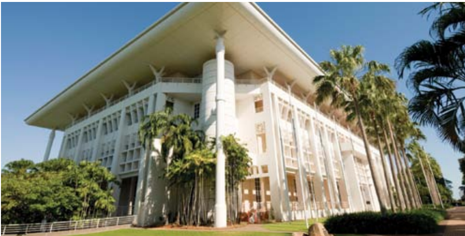
Darwin • Northern Territory Parliament