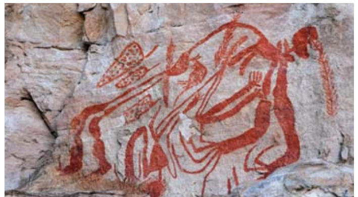
Ubirr - Aboriginal Art