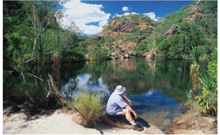
Kakadu National Park