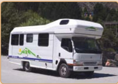
United 6 Premier