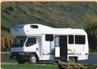
United 4 Premier