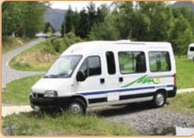
United 2 Premier