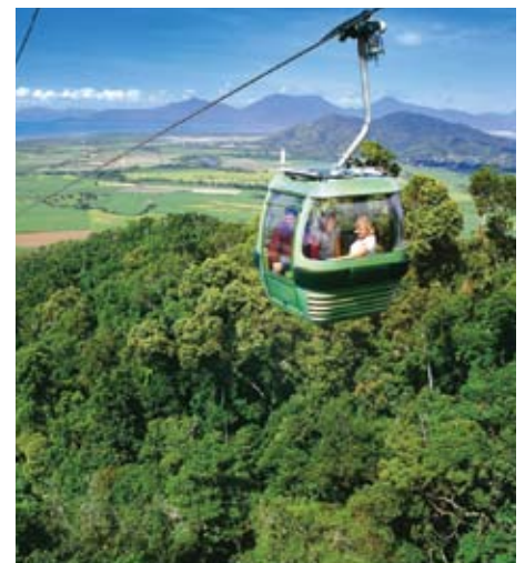
Kurunda · Skyrail Rainforest Cableway

Day 12 Sydney Sights, Sydney Harbour Cruise, Opera House Guided Tour. Today, step inside the Sydney Opera House during a guided tour. Then board a luncheon cruise on Sydney Harbour, viewing the iconic Harbour Bridge and Opera House from a different perspective. Later, discover Hyde Park and the famous Bondi Beach on a guided city tour. (B/FL)