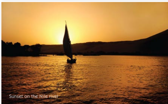
Sunset on the Nile river