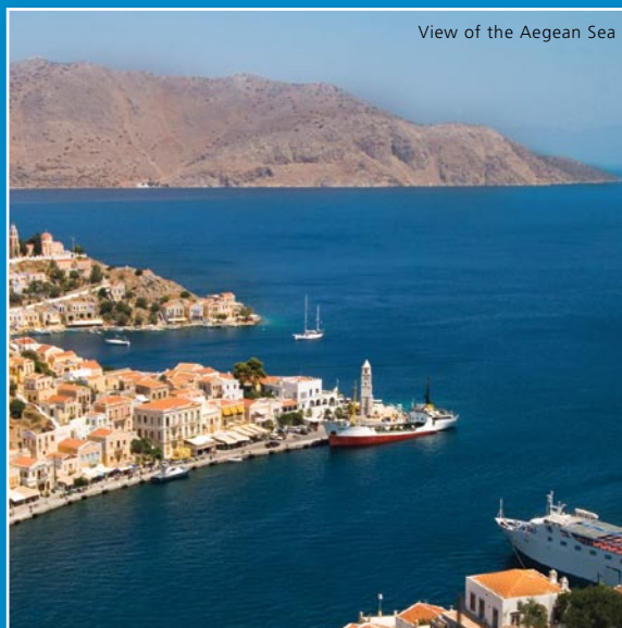
View of the Aegean Sea

ATHENS GLYFADA VOULIAGMENI CRETE RHODES NAUPLION