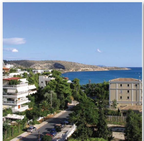
Suburb of Vouliagmeni

See page 40 for a list of optional sightseeing tours and excursions