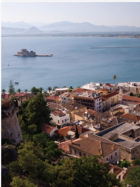
Bay of Nauplio