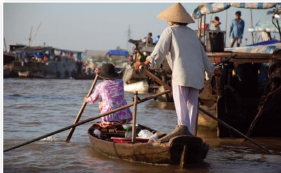
Day 11 • Mekong Delta - Visit the floating market