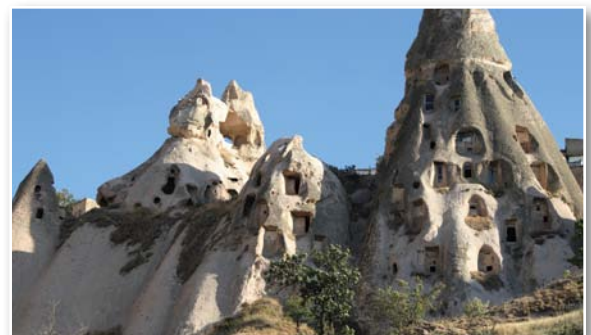
Day 9 • Cappadocia

Day 12 Istanbul • Canada • Breakfast. Transfer to the airport for your Air France flight back home. Arrival in Toronto or Montreal the same day.