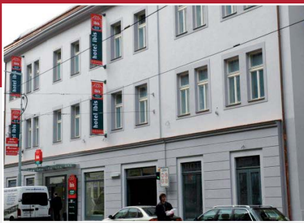
IBIS OLD TOWN

Visit one of the three greatest cities of Eastern Europe during your next trip with Exotik Tours. See the historical Heart of Bohemia with Prague. Grandiose Vienna showpieces the all-conquering Habsburg-Dynasty monuments. Budapest, Hungary's capital deserves, its reputation as the "Paris of Central Europe". You have more time ... combine 2 or 3 cities with the train, transfers and a variety of optional excursions. Ask your travel agent!