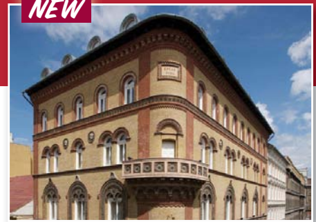
MERCURE MUSEUM HOTEL

Departures from other Canadian cities are available. Rates on request.