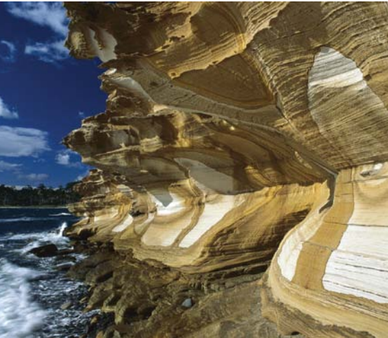
Tasmania National Park