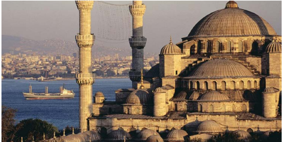
Blue Mosque Istanbul