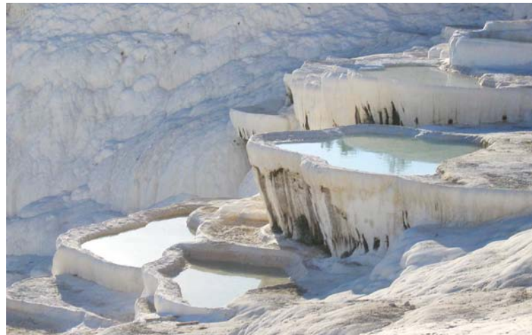
Pamukkale Hotspring Waterfalls