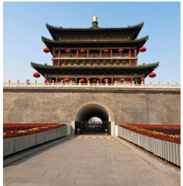
Xian City Walls

Transportation • Return air transportation from Vancouver with Air Canada in specific limited class of service • Domestic flights in economy class • Transfers • Guides • English speaking local guides • Accommodations and meals • Accommodation in 4* and 5* hotels, double occupancy • 22 meals: 9 buffet breakfasts, 8 Chinese lunches and 5 Chinese dinners • Transfers to/from airport to hotels • Sightseeing with English speaking local guides • Not included • Visa for China: $95 • Gratuities to hotel personnel, guides and drivers. • Optional excursions • Beverages • Airport/security taxes and service charges: $350 • Note: Visa required for China.