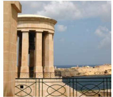
View of the Lower Barracca Gardens in Valetta, Malta.

An action-packed spectacular musical dinner show, with 50 talented performers and 8 trained horses! Enjoy a 3 course dinner with free flowing wine, as the world famous Knights of St. John, clad in shining armour, ride their proud steeds to give battle to the colourful warriors of Suleiman the Magnificent in the epic siege of 1565. Relive the splendour of 16th century pageantry and join in the fun of a village fiesta. Share the excitement of two young lovers as they softly dance their way into each other's heart and succumb to the sensuous pleasures of a mysterious oriental harem. A pulsating spectacle for a memorable, complete night out!